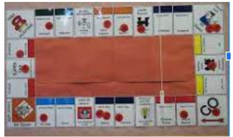
Be here to have a go! This week's winners & rewards:

Each week in assembly a dice will be rolled for most improved class attendance.