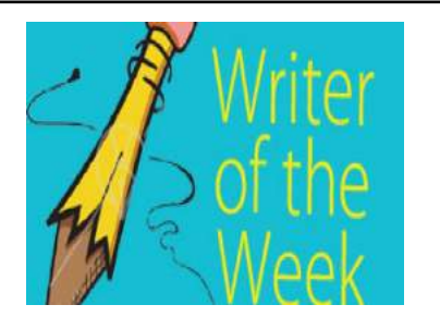
Class: Kerr Pupil: Amelia

Strong class have also used this opportunity to practice using Times Table Rockstars in the hopes that they will be able to earn their level 1, 2 & 3 badges for knowing all of their times tables and being able to recall them within 6 seconds.