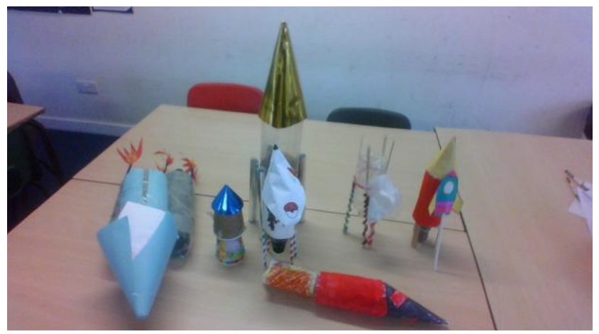
This is a small selection of the rockets produced in Riordan Class Year 5

At school, the theme this term was 'How high can it go?' Students were asked to build a rocket, spaceship or anything that would 'lift off' so that we could judge how high it would go off the ground or from a fixed starting point. Any materials could be used from home or outside and many people chose vinegar and baking soda, pumps attached to bottles or just straws and a balloon which you would blow into.