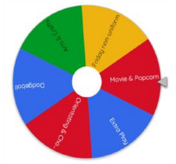
Each week in assembly the wheel will be spun for <u>most improved</u> <u>class attendance</u>

Be here to have a go! This week's winners & rewards: