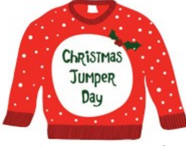
(no donation needed)

Wear a Christmas Jumper on 18th December